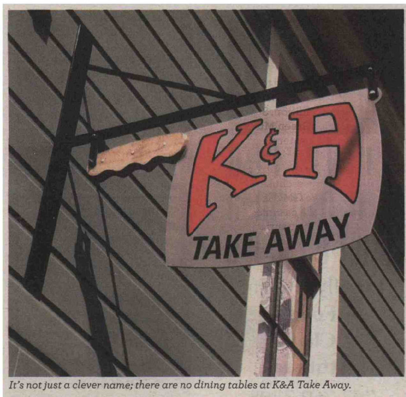
It's not just a clever name; there are no dining tables at K&A Take Away.